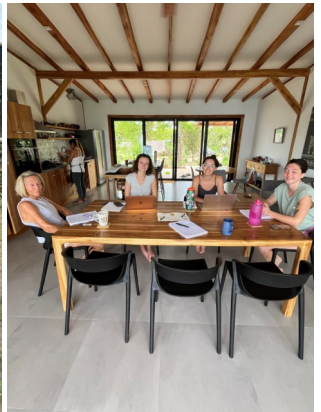
Planning Future Activities