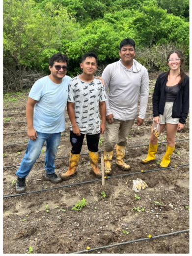
Working as a team in agriculture