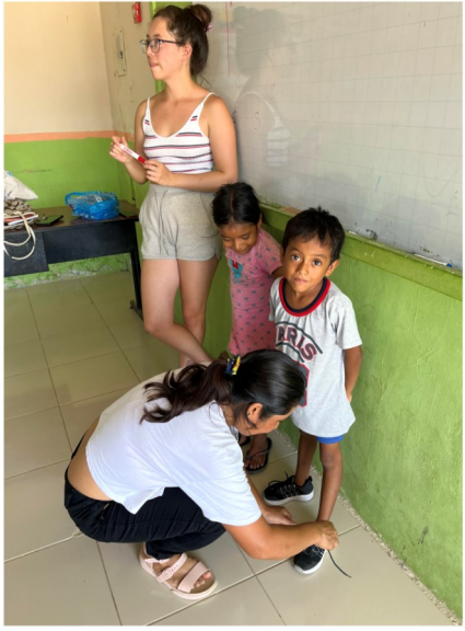
Tying Shoes is part of the English Class

Dos Corrientes remains steadfast in its commitment to addressing issues such as food scarcity, education, employment, self-sufficiency, and equality. Rather than viewing these challenges as roadblocks, we see them as opportunities for innovation and progress. Through strategic investments and collective action, Dos Corrientes aims to create a brighter future where access to essential resources is recognized as a fundamental right, and communities flourish in harmony with their environment.