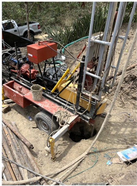
Drilling the Smurfit Kappa

A notable highlight in the coming weeks will be the completion of a well generously donated by the Smurfit Kappa Foundation in Ireland. Digging this well has proven to be a challenging endeavor. Electronic scanning confirmed the presence of water on our farm, but unexpected rocky obstacles complicated the process. Drilling machines were damaged, casings got stuck, and part of the newly drilled well even collapsed while attempting to free the stuck casings. However, after months of perseverance, we've made early detections of salt-free water. Soon, the well will be fully operational, powered by a submersible solar pump, and the water will be transported through a tubing system to our agriculture area, just in time for the 2024 school season.