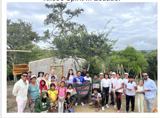
Kilcoo Spirit in Ecuador