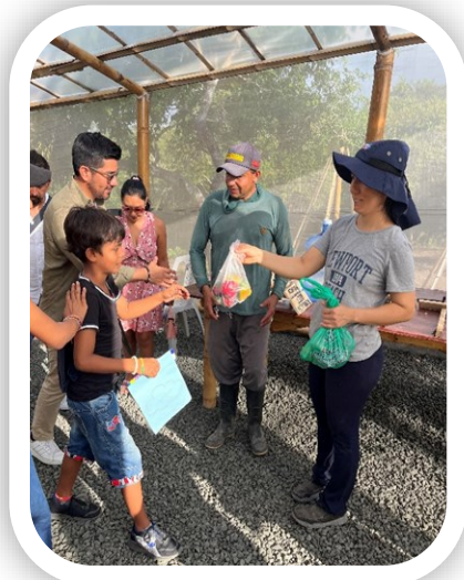
Distributing food to 35 families at the agriculture