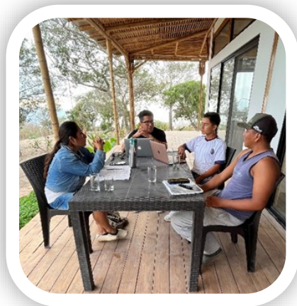
Business Incubation: Learning about starting a clothing sales business, a technology business and an agriculture business