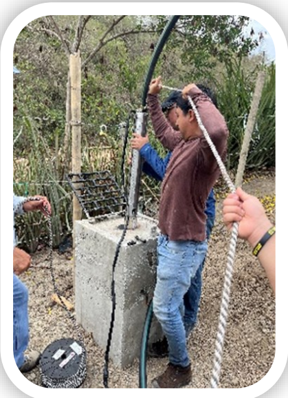
Lowering the pump in the SKF well