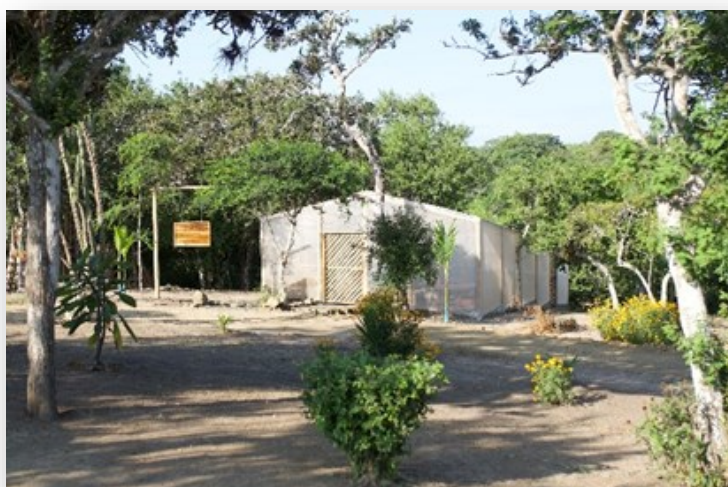
The Rotary Greenhouse/Education Centre