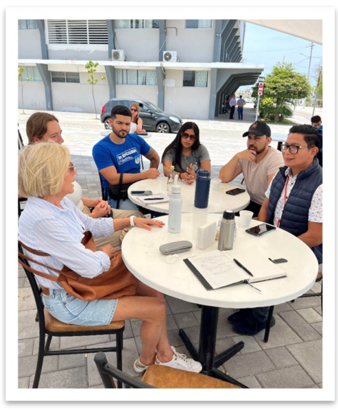
Planning the Dos Corrientes Education Programs

also allows the student-teachers from Manta to refine their teaching abilities. Starting in October, these classes will bring immediate benefits to the region.