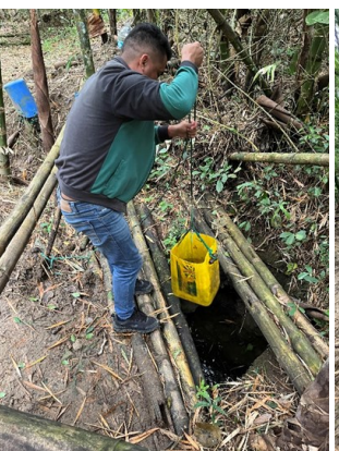
The Ancestral Well Site Still Exists Today

We call on our donors and international partners to help fund these critical projects. With your contributions, we can install energy-efficient systems and ensure the people of Liguiqui have access to clean water-creating a model for sustainable water management in rural areas.