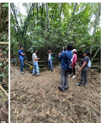
Professors from ULEAM and Community Leadership Discuss the Water Problem

Donate today and be part of the solution to the water crisis in Liguiqui. Together, we can bring lasting change to this resilient community.